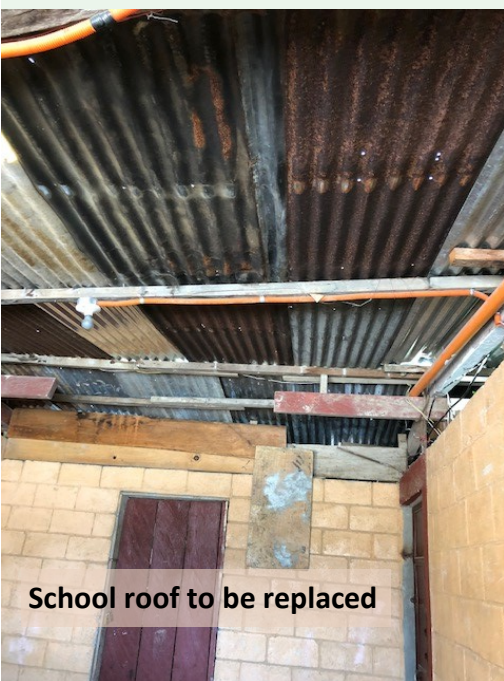
School roof to be replaced

We are so excited about the upcoming trips to Guatemala. At this point, we have a small construction team headed to