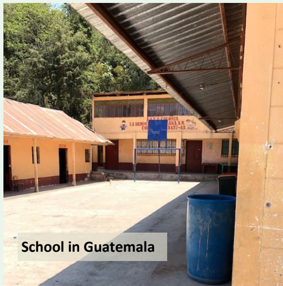
School in Guatemala